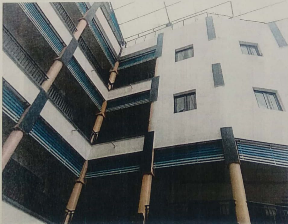
NO SIGN OF ANY LEAKAGE OR DAMPNES IN WALLS