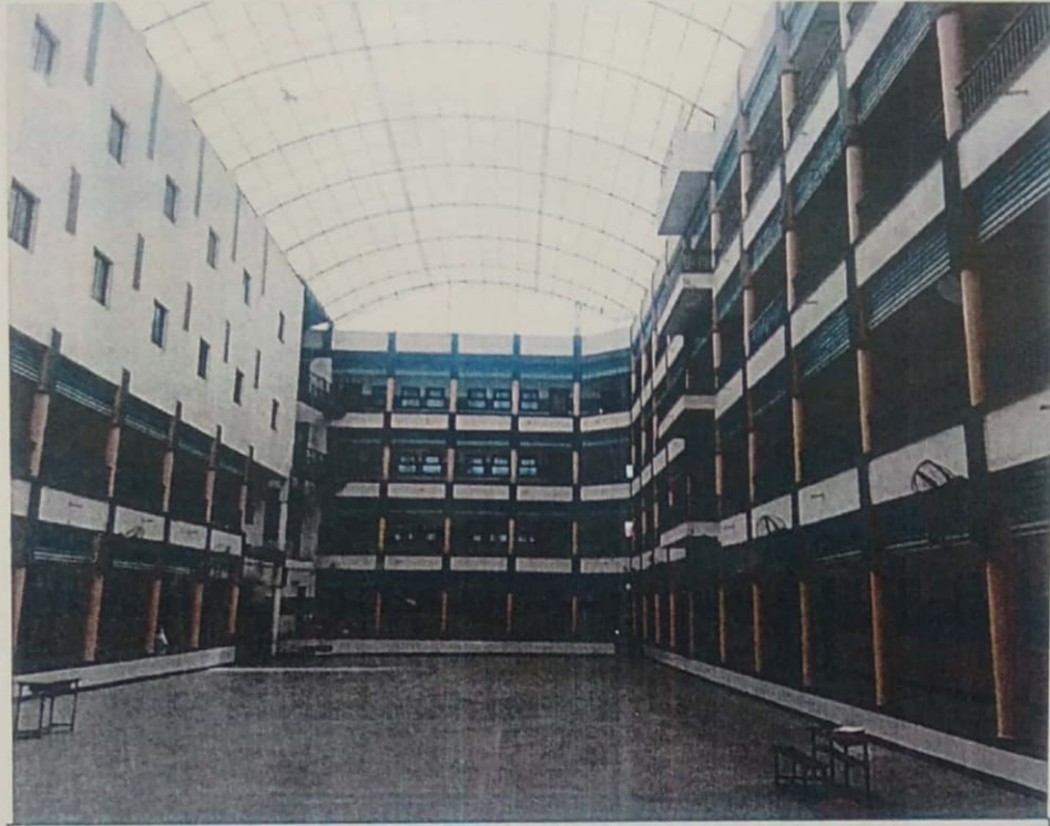
ASSEMBLY AREA OF THE SCHOOL G+3 STOREY SCHOOL BUILDING