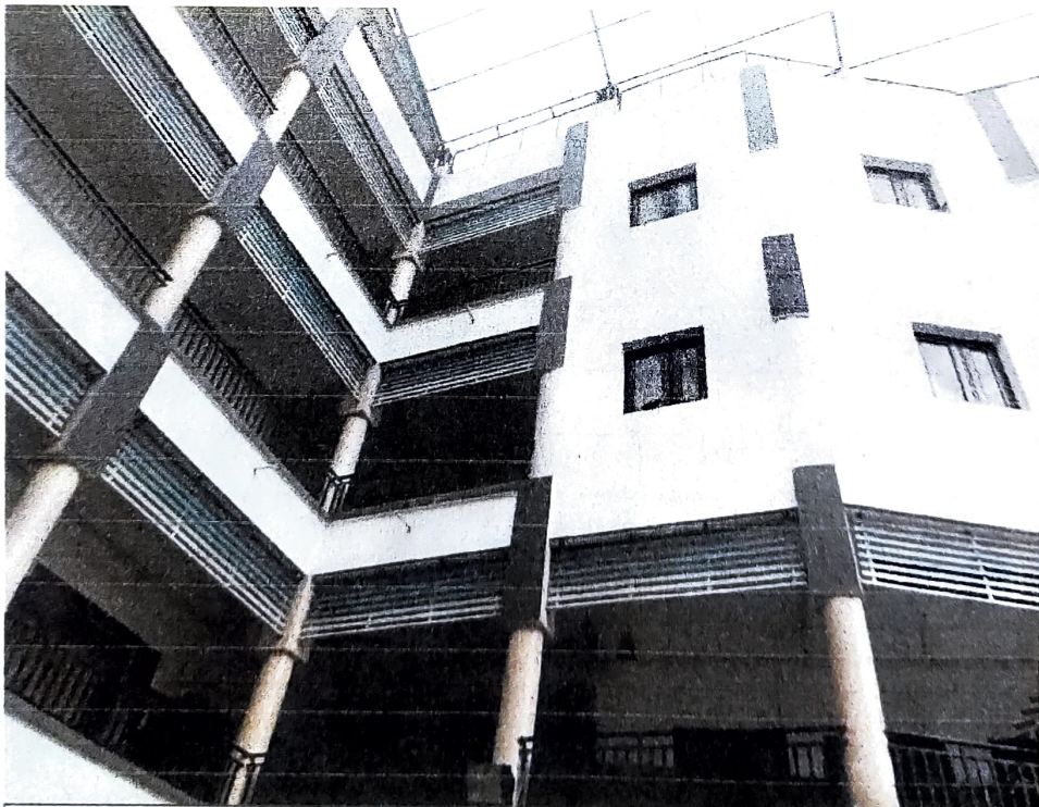
NO SIGN OF ANY LEAKAGE OR DAMPNES IN WALLS